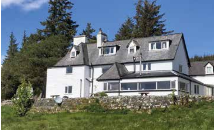
Fig.2: Former Inn at Overscaig.

building in concrete became an economic alternative to building in brick and stone, and for the two decades between 1860 and 1880 there was something of a craze for this new style of construction. One of its most enthusiastic proponents was the third Duke of Sutherland, whose name as a satisfied client appeared prominently in the prospectus 2 of the patentee of the apparatus, and builder in concrete, Charles Drake.