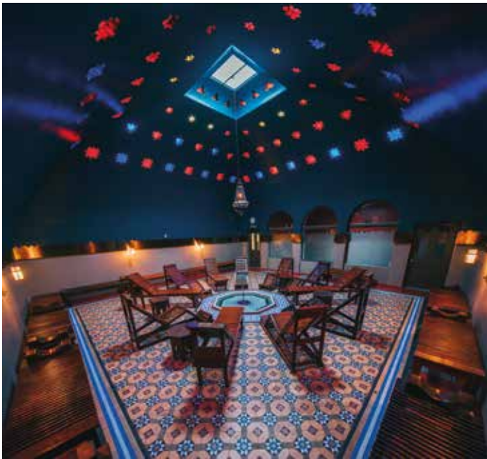
Fig.10: Turkish Room, Arlington Baths, Glasgow.