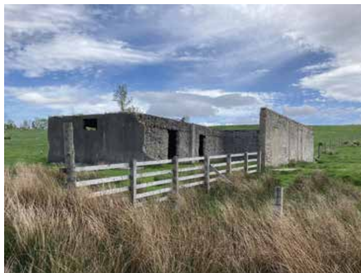
Fig.9: Unfinished farm buildings, Bannockburn, Kinbrace.

Cost was a powerful driver for the use of concrete over more traditional materials. James Macdonald tells us that the cost of each of the farms was £450, which contrasts with the £2,000 for similar buildings at Shinness built of stone.