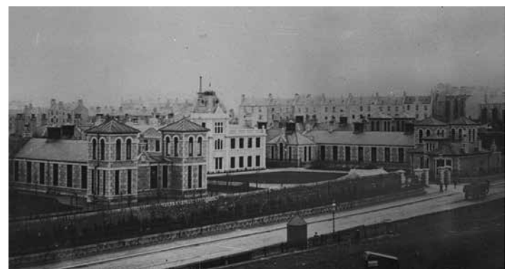
Fig.6: Epidemic Hospital, Urquhart Road, Aberdeen, 1900.