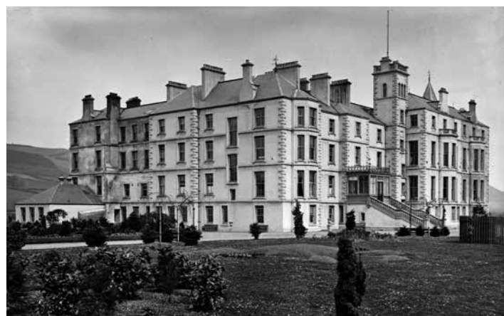
Fig.7: Waverley Hydropathic Establishment, 1876.