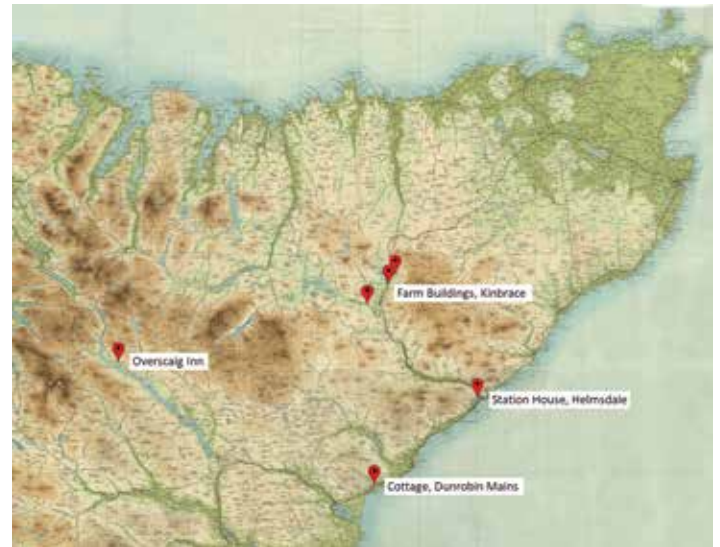
Fig.5: Concrete buildings in Sutherland mentioned in this article.