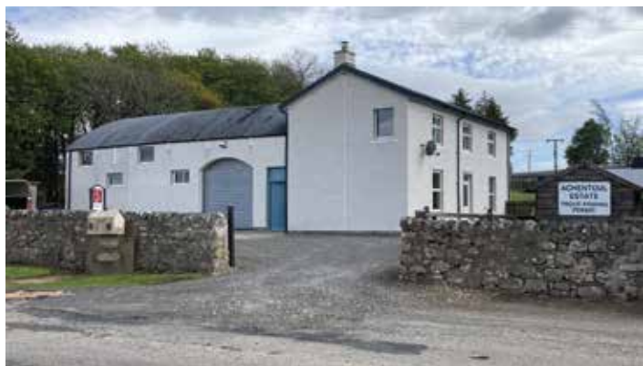
Fig.8: Concrete farm buildings, Lochside, Kinbrace.

This must surely be the first use of the word 'utopian' in connection with concrete: what it meant was that possibly for the first time in their lives, workers' families could live in a clean, dry house that was free from vermin and easy to keep warm.