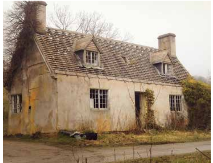
Fig.3: Cottage at Dunrobin Mains, shortly before demolition in 2020.