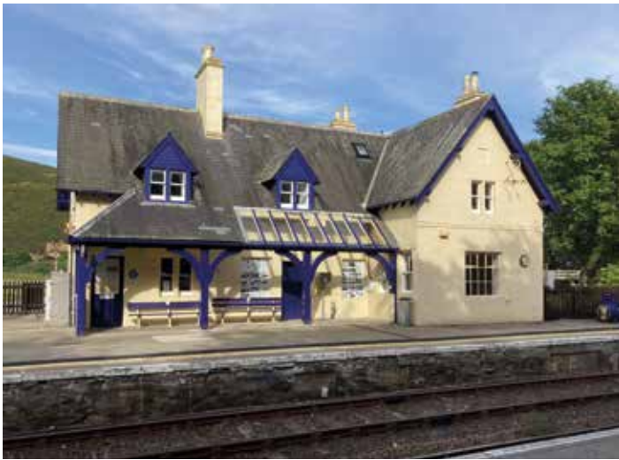
Fig.4: Helmsdale Station.