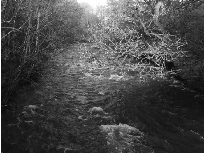
Fig.4: Allan Water in spate following the thaw in 2010. Similar spates in March 1674 caused new disruption.

freezes only after prolonged spells of very cold weather. December 2009 and January 2010 were the coldest two months in Scotland since records began in 1912, with daytime temperatures down to minus 12 C; the Forth froze at Stirling Bridge on 10 January 2010. 75