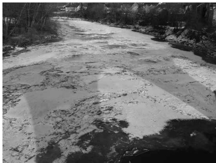
Fig.3: The Forth frozen above Stirling Bridge, January 2010 (as in March 1674).