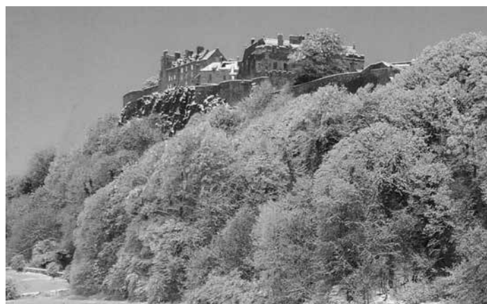
Fig. 1: Stirling Castle, December 2009. It takes a good breakfast and warm clothing to make this scene beautiful.