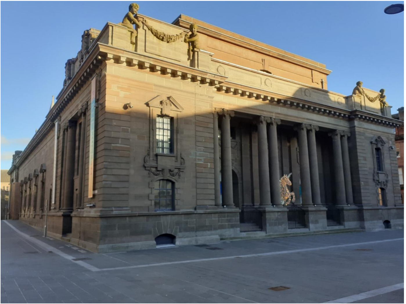
Perth Museum 22 February 2024

■ The new Perth Museum will open to the public on Saturday, 30 March 2024. Among the items that will go on display are Bonnie Prince Charlie's sword, a rare Jacobite drinking glass and the ancient Carpow log boat. A major attraction will be the Stone of Destiny which is being moved from Edinburgh Castle to form the centre-piece of the new museum. The former City Hall in the centre of Perth has been redesigned by Netherlands-based architects, Mecanoo, to house and showcase the significant collections of Perth Museum, amassed over the last couple of hundred years. The first special exhibition will centre on Scotland's national animal – the Unicorn. Unicorn - Perth Museum